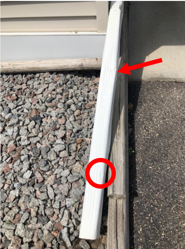
Multiple dents found on downspout extension caused by hail strikes.