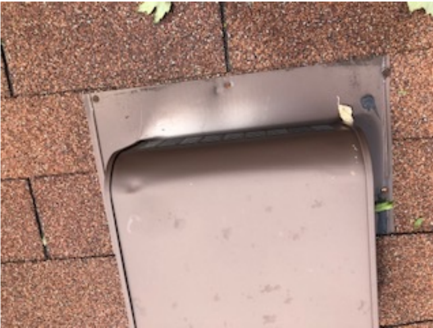
Dented roof vent.