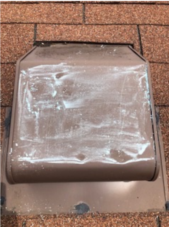
Hail was large enough to damage the steel roof vents.