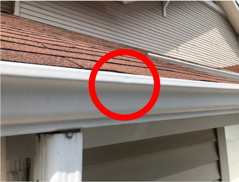
Damaged observed to the aluminum gutter caused by hail strikes.