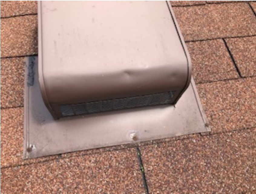
Damaged roof vent caused by hail strike.