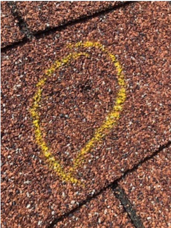
Significant damaged caused to the shingle by a hale strike.