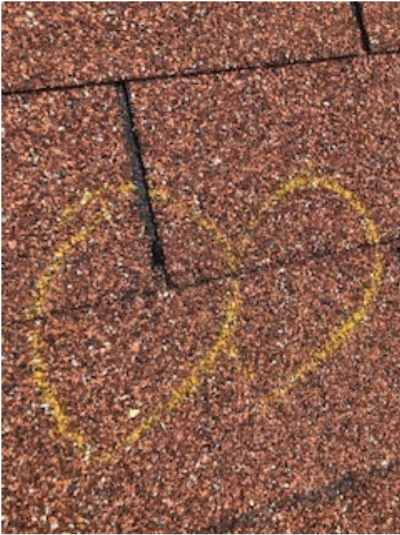
Multiple hail strike to the shingles.