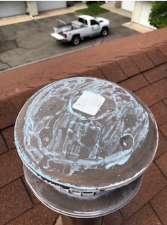
Several hail strikes to the furnace exhaust cover.